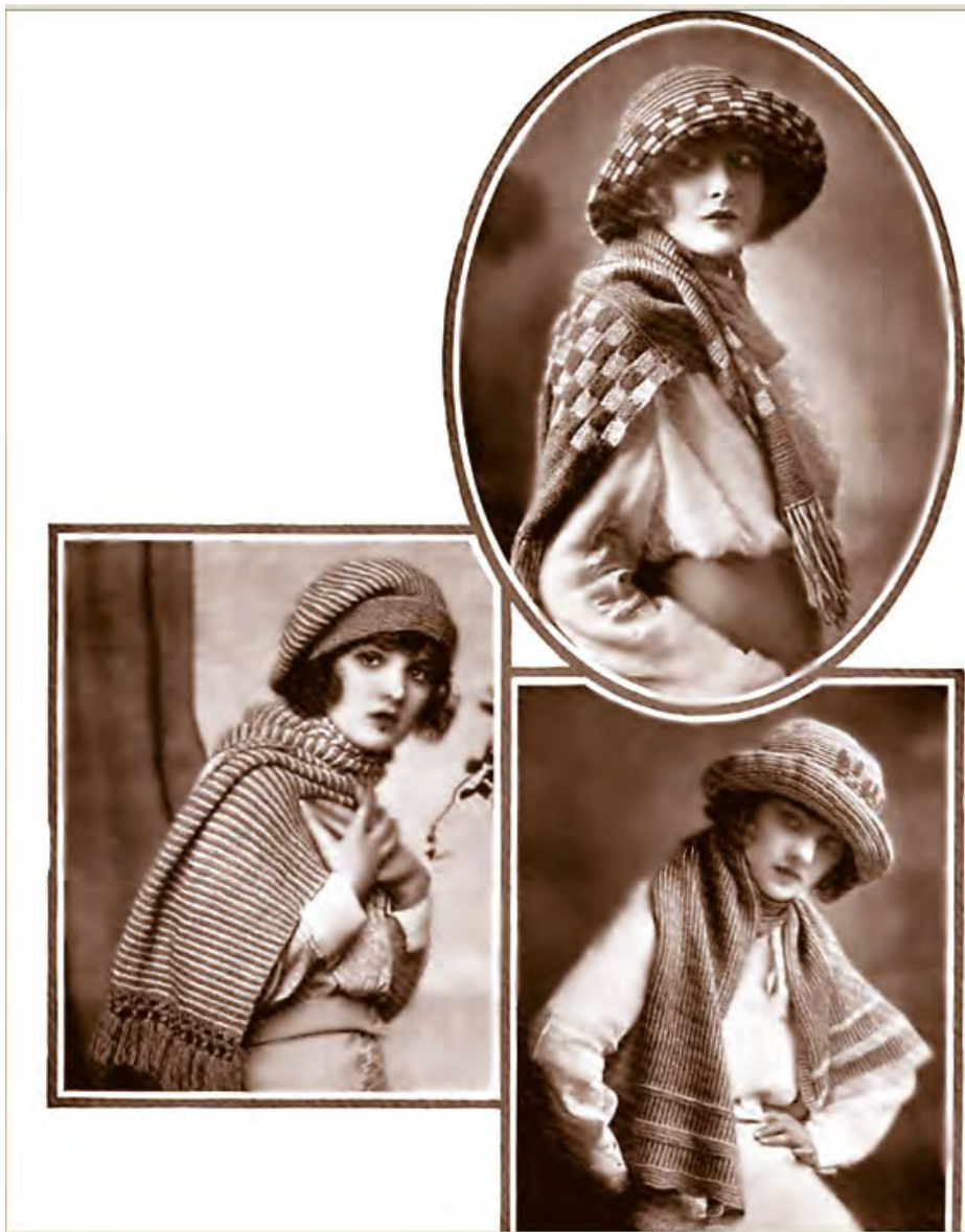
Claremont (top), Devereaux (left) and Duncan (right) hat and scarf sets

From "Fleisher's Knitting and Crochet Manual," 1922. Claremont: A smart use of the popular checker-board pattern. Devereaux: A simple knitted scarf and tam, made distinctive by well-proportioned stripes. Duncan: The scarf is two-toned, the darker color showing in the fluted rows. The design on the hat is knitted in. (For a photo of the Iris Hat, see the Somerville Sweater .)